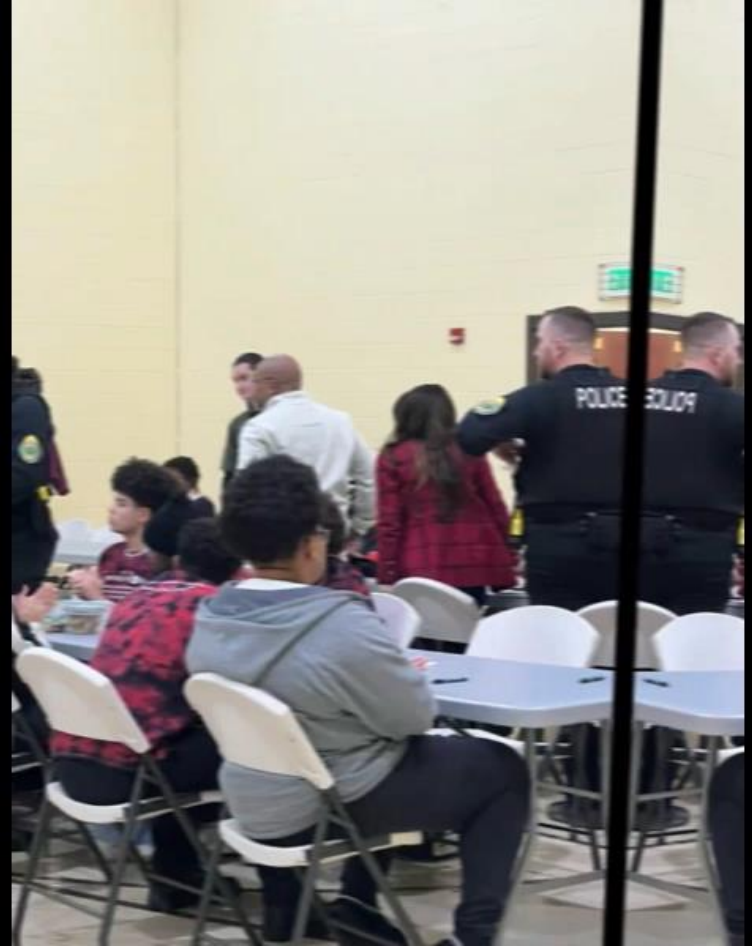
Gun Violence Youth Roundtable Discussions and School Public Safety Listening Sessions in Muncie, Indiana