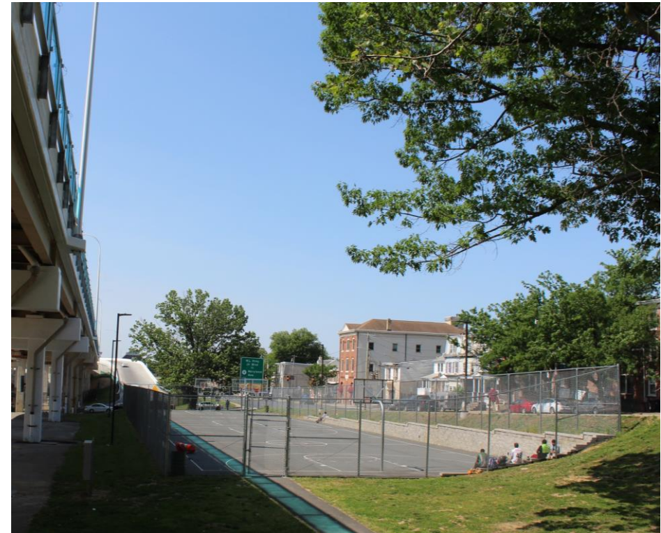
Temporary Courts along N. Jackson Street